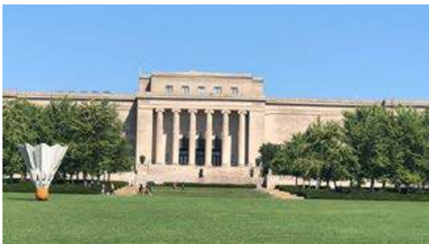
The Nelson-Atkins Museum of Art

However, sometimes there is nothing like the real thing. We have a world class museum (with free entry!) right down the street. We visited as a guild activity a few years ago,