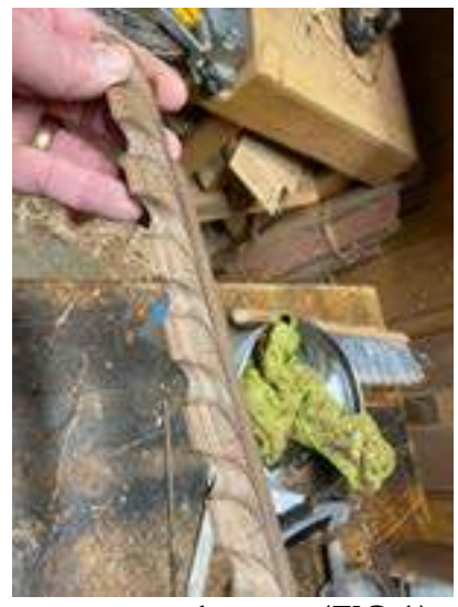
tear-out or chipping (FKgul).1

4. Now round over the convex sections with chisels. Shallow gouges or flat chisels can be used. At this point I like to smooth out the moldings with a file, which helps in the next