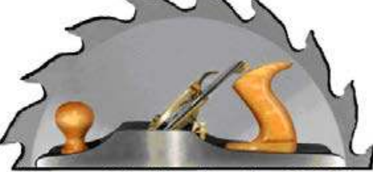
Kansas City Woodworkers' Guild

PUBLISHED BY THE KANSAS CITY WOODWORKERS GUILD * 3189 MERCIER ST * KANSAS CITY * MO * 64111