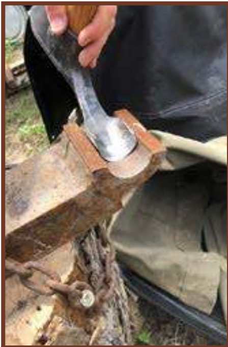
Tracey Cheuvront showing the way he creates the curve for his adze.

This program should totally satisfy those who have asked for more programs where somebody actually does something, which is often not possible due to safety concerns from