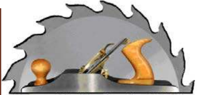
Kansas City Woodworkers' Guild

PUBLISHED BY THE KANSAS CITY WOODWORKERS GUILD ★ 3189 MERCIER ST ★ KANSAS CITY ★ MO ★ 64111