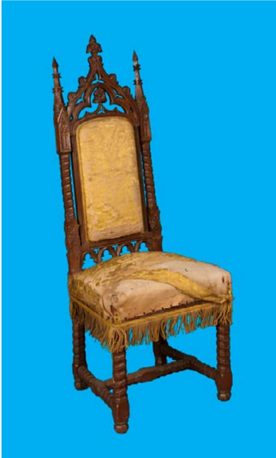
Calvin Hobbs Antique Repair