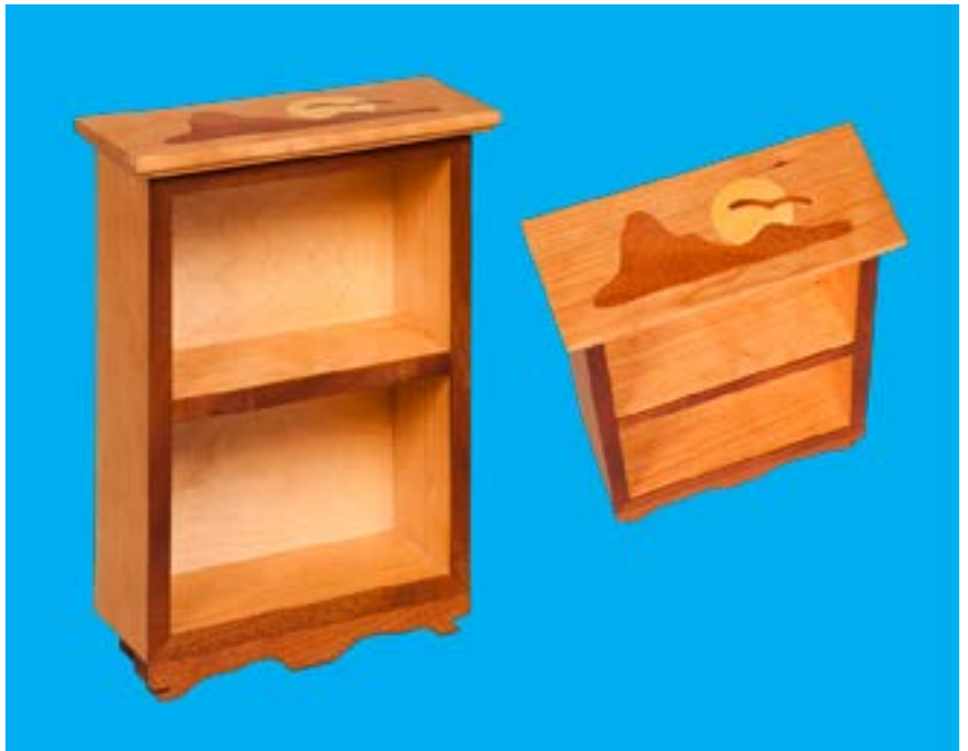
Doug Courtright Basic Woodworking Class Spice Rack Materials Used: Cherry & Mahogany Finish Used: Poly Points of Interest: Trim