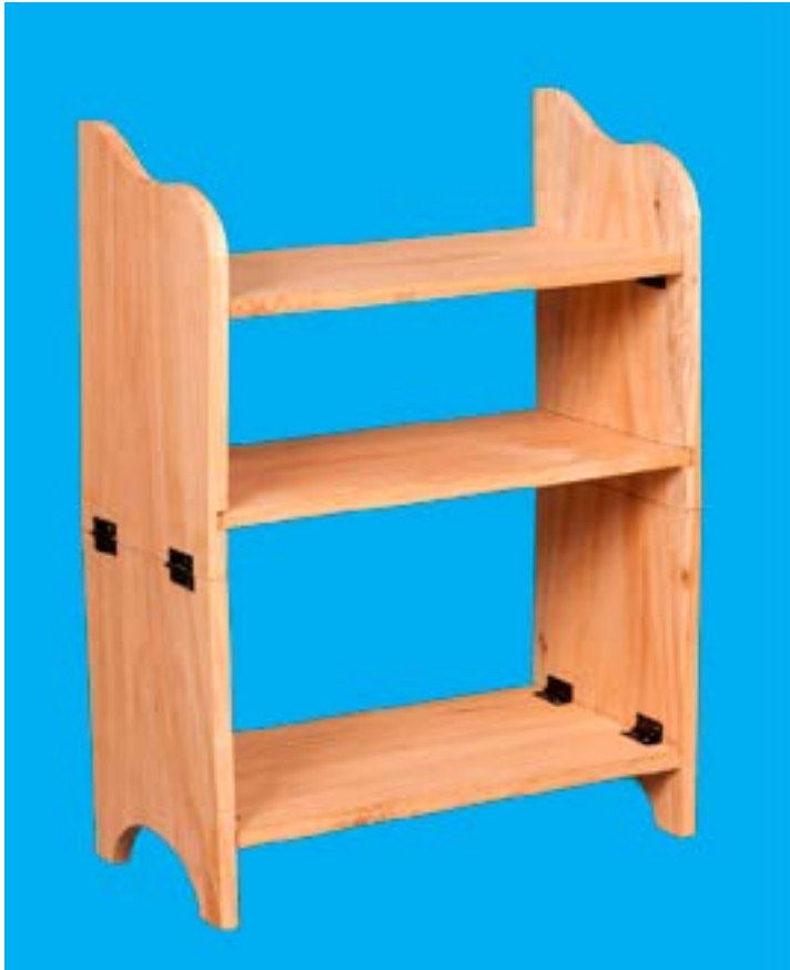
Chris McCauley Collapsible Book Case Materials Used: Red Oak Finish Used: None