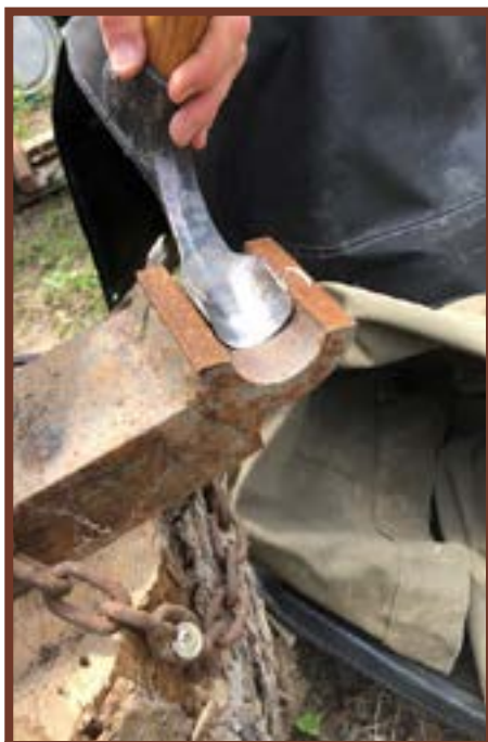
Tracey Cheuvront showing the way he creates the curve for his adze.

This program should totally satisfy those who have asked for more programs where somebody actually does something, which is often not possible due to safety concerns from