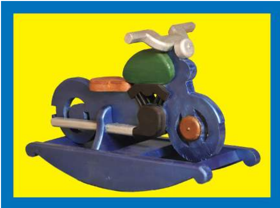
Greg Strasser; Rocking Cycle – Fir & Paint