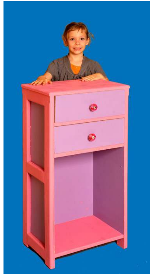
Meghan McCauley - Age: 7 (Daughter of Cristopher); Night Stand – Pine; Pink & Purple Paint.