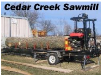
Cedar Creek Sawmill