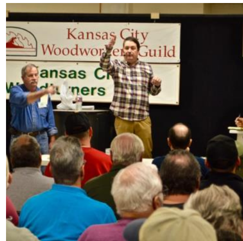
The auctioneer enticing bids. (right, top and bottom)