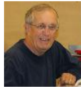
Members inspect the wares (left, top and bottom)