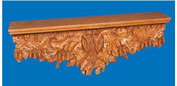
Mike Resch