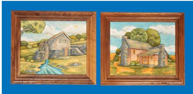
Mike Resch