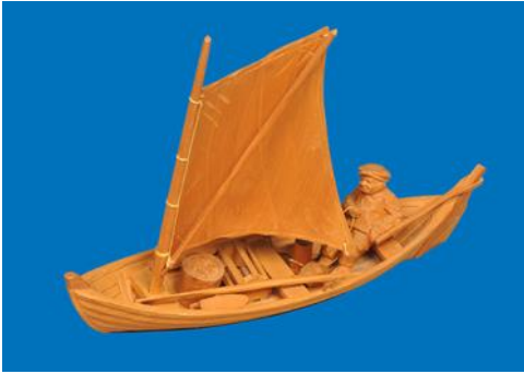
Tom Webb