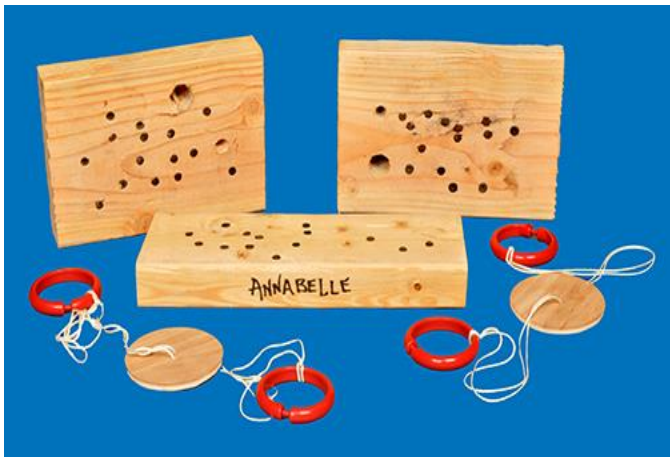
Smithville Montessori