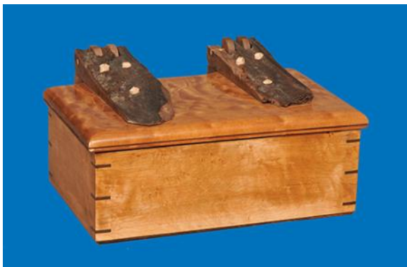
Craig Arnold