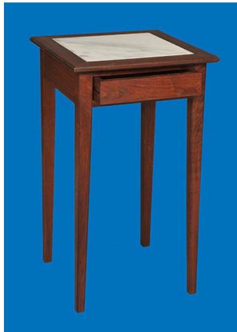
Roland Mahler