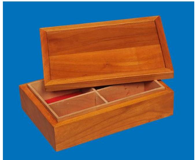
JSergio Rodriquez