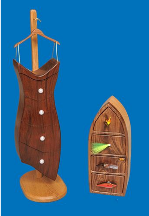
Jim Ramsay

“The greater the difficulty, the more the glory in surmounting it.” — Epicurus