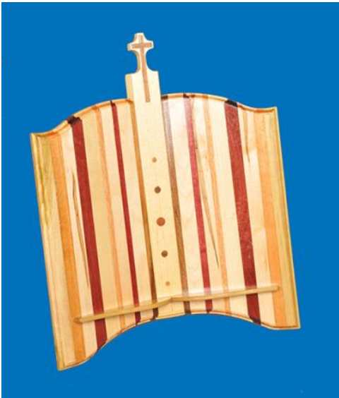
Sergio Rodriguez—(picture credit N. Shoger)