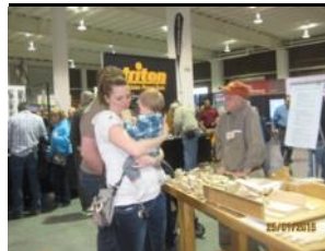
Discussing Finer Points of Toy Making with Local Expert