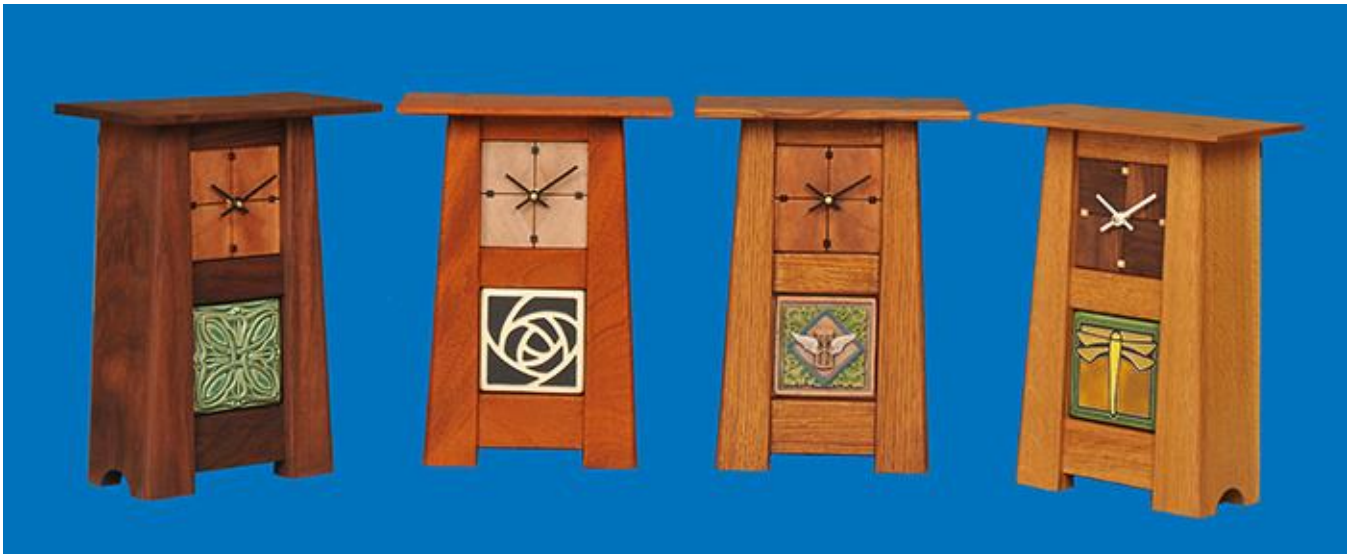
Craig (I'm Late, I'm Late, I'm Late for a Very Important Date) Around : Four Clocks