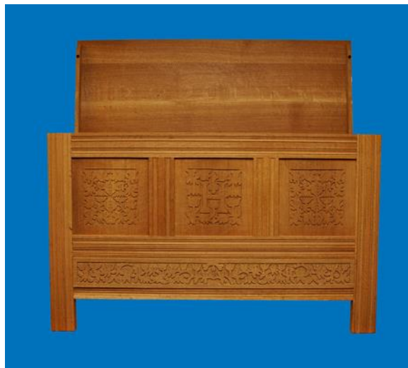
Calvin Hobbs : White Oak Blanket Chest (please consider ammonia fuming as a finishing step)