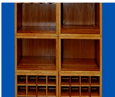
Wine Rack by Jerry Stanley

challenges shaping handle after glue up, should have band sawn first!