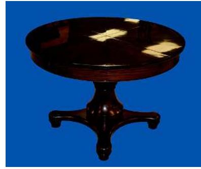
Oval Table by Tom Smoller Made with ash & maple Finished polyurethane Point of interest design