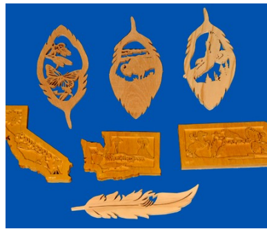
Willy Spangler created these very detailed scroll pieces. Willy claims he just whipped