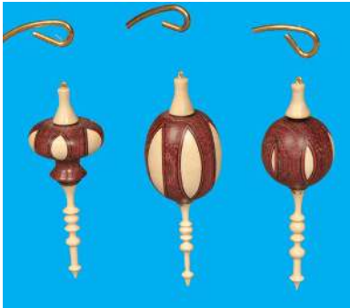
Ornaments by Bill Kuhlman