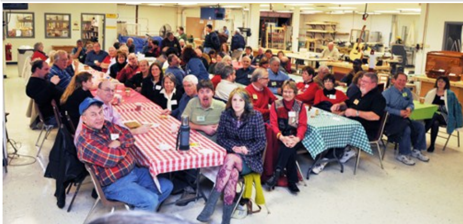
Holiday banquet— good food, good friends, and lots of stories, most of them true.