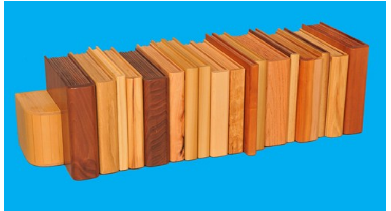
Award winning jewelry box with hidden compartments