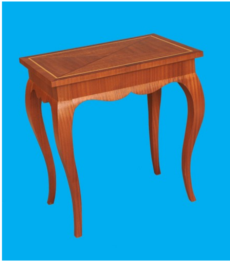
Ron Lomax table