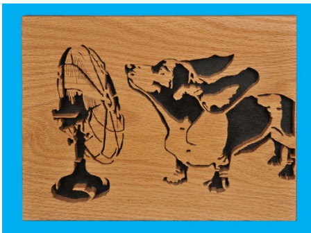
Bill Nagel—scroll saw work