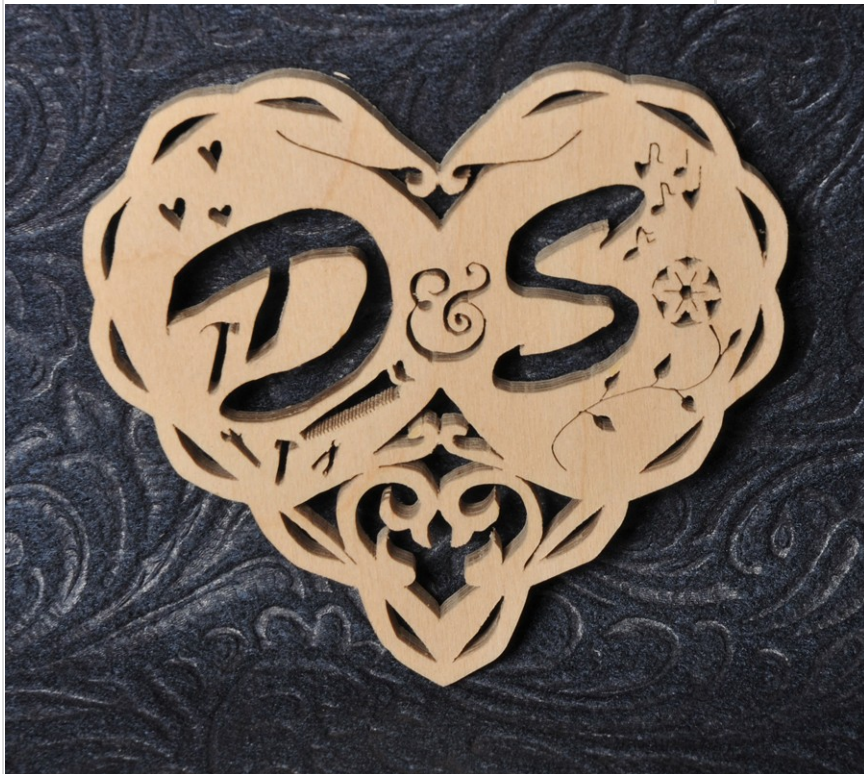
Scroll Work by Spring Fisk