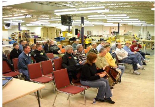
The Rough to Ready workshop

Cutting Crown, Chair Rail, & Molding Clinic