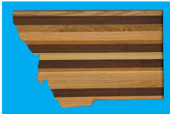
Cutting Board Shaped like the state of Montana by LaDonna Southland