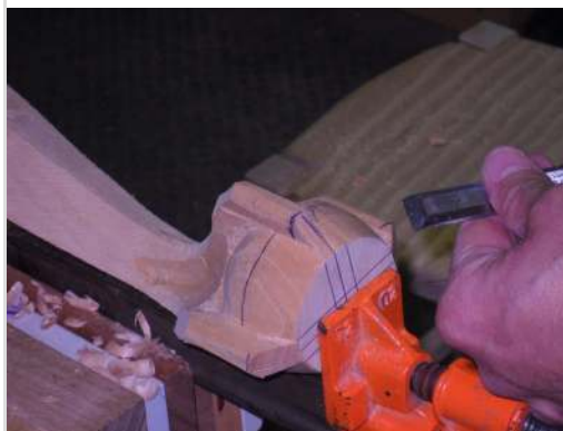
Rouging in the pearl held by the dragon's tallons.