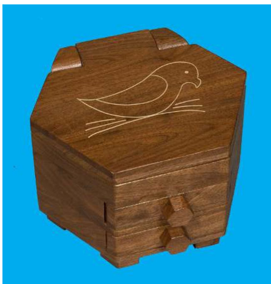
Jewelry Box of Walnut with Holly Inlay Finished with Shellac By Ron Lomax