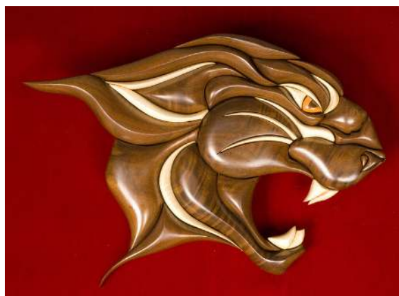
Cougar of Walnut & Fiddle Back Maple Finished with Shellac, Varnish, & Wax By David Roth