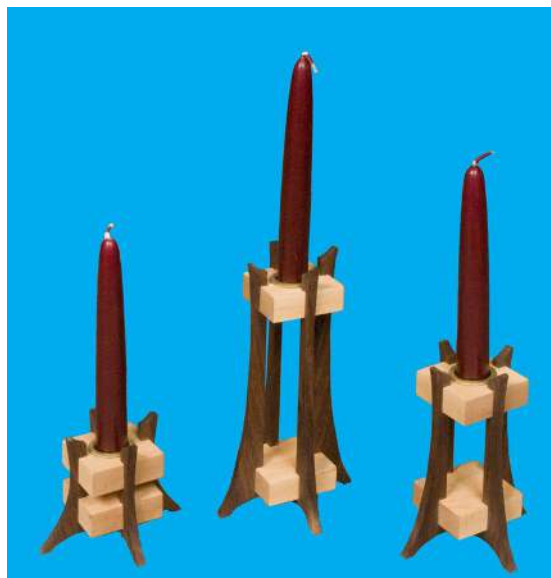
Candle Sticks of Birch & Walnut, Finished with Watco Oil By John Tigeler