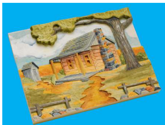
Stan Dirksen- Relief Carving & Painting