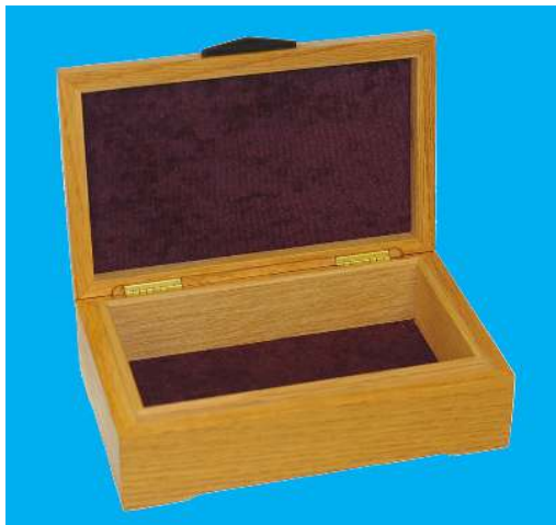
Jim McCord- Boxes made with maple and padouk, with patterned tops