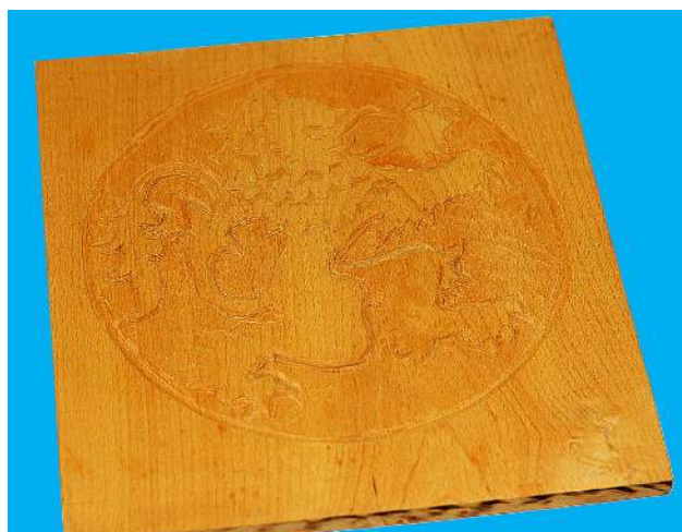
Stan Dirksen- Relief drawing made with basswood