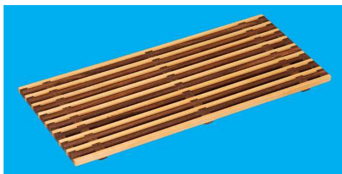
John Tegeler- Large trivet made with maple and walnut strips