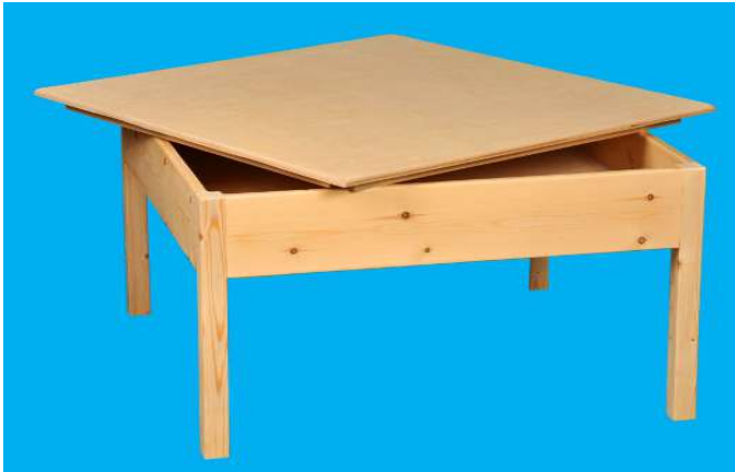
Cliff O'Bryan- Raised sandbox