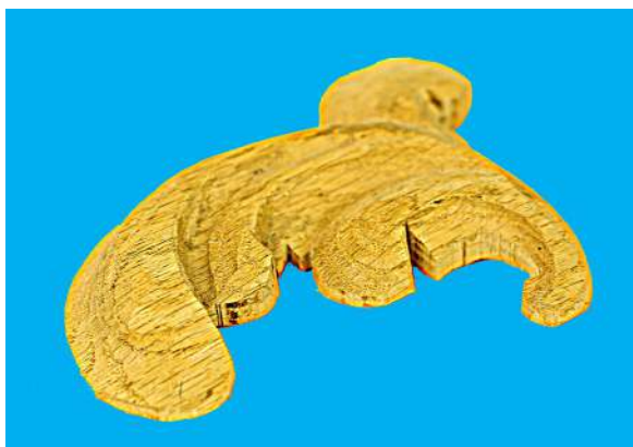
Bill Fitzgibbons- Wood carvings