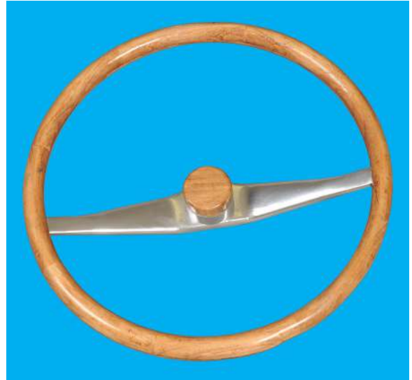
Bill Kuhlman- Re-furbished steering wheel using cotton- wood