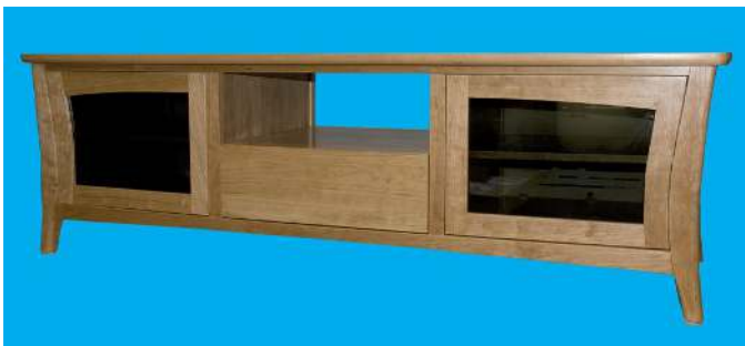
Ron Lomax—entertainment console, smoke glass