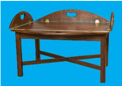
Jim Stuart—butler's table, walnut with maple banding