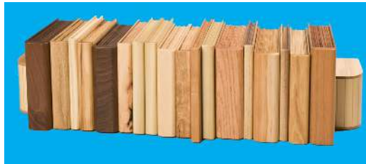
Russ Amos—wooden “books” jewelry box with hidden compartments, closed and open