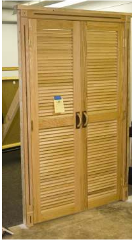
Jim Bany—cedar closet doors