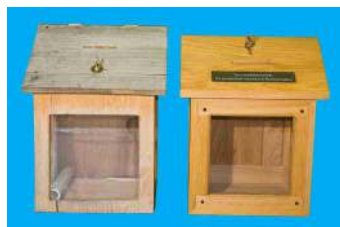
Ron Lomax -Donation Box