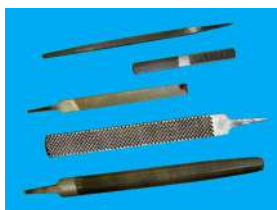
Kevin McAndrew - Sharp files and Puzzle Box