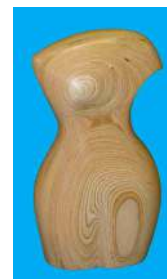
Mary Ripka - Plywood Sculpture