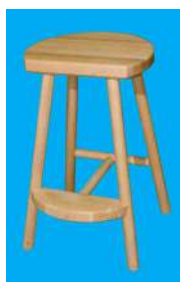
Jim Bany - Shop Stool