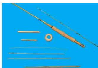
Ken Grainger - Bamboo Fly Rod