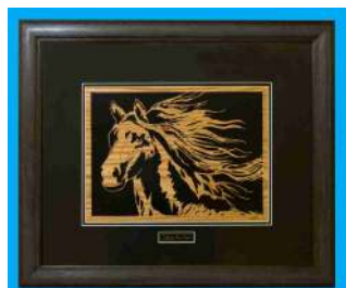
B. Varney - Scroll sawn horse