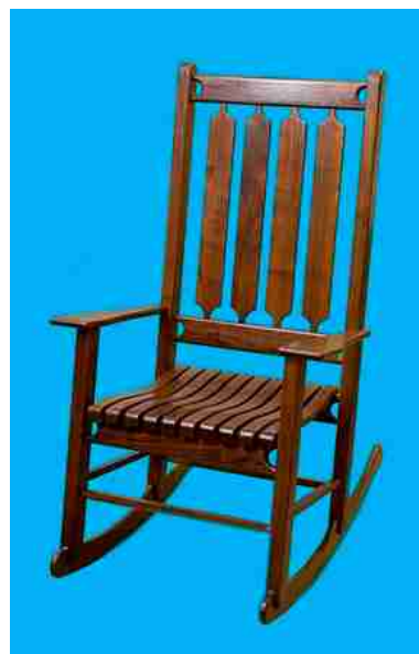
Jim Stuart – Walnut Rocker from Wood Magazine May 2008 Issue #183