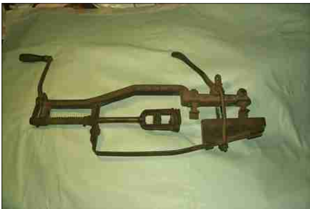
Spoke Tenoning Machine

This particular tenoning machine was patented OCT 17, 1911 and is marked with the name "EVER READY 1".