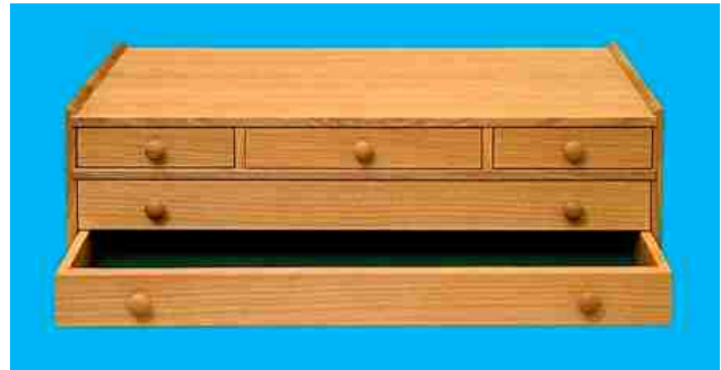
Phil Akers – Oak Tool Chest