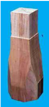
Russ Amos – Japanese style Table leg