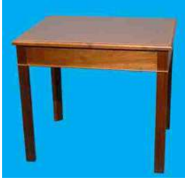
Dale Albert – Lamp Table