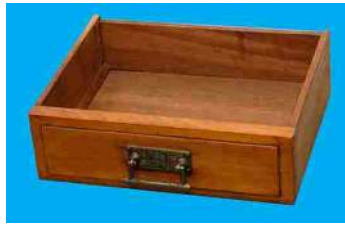
Frank Layne -English Dressing table drawer