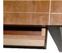
Frank Layne's Cherry/Maple End Table (and detail) made from bin scraps