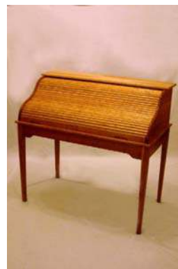
Roll Top table