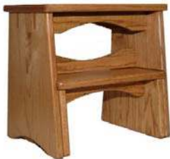
Brian Kemp's Cabriole