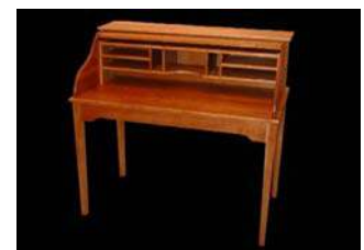
Roll Top table opened