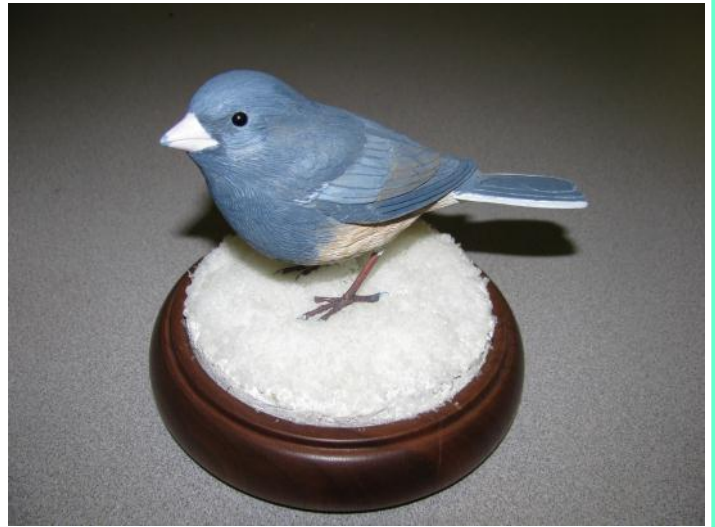
Snow Bird, by: Ed Burton