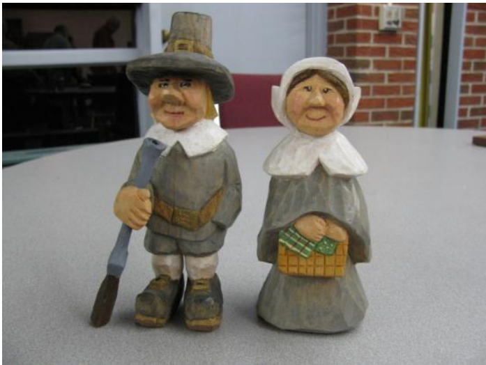
Pilgrim Couple