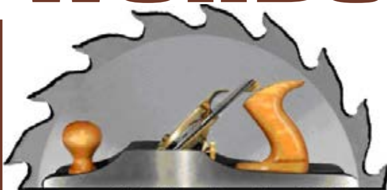
Kansas City Woodworkers' Guild

PUBLISHED BY THE KANSAS CITY WOODWORKERS GUILD ★ 3189 MERCIER ST ★ KANSAS CITY ★ MO ★ 64111